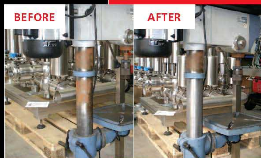
Before & after treatment with Innosoft B570